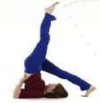
Eka Pada Sarvangasana